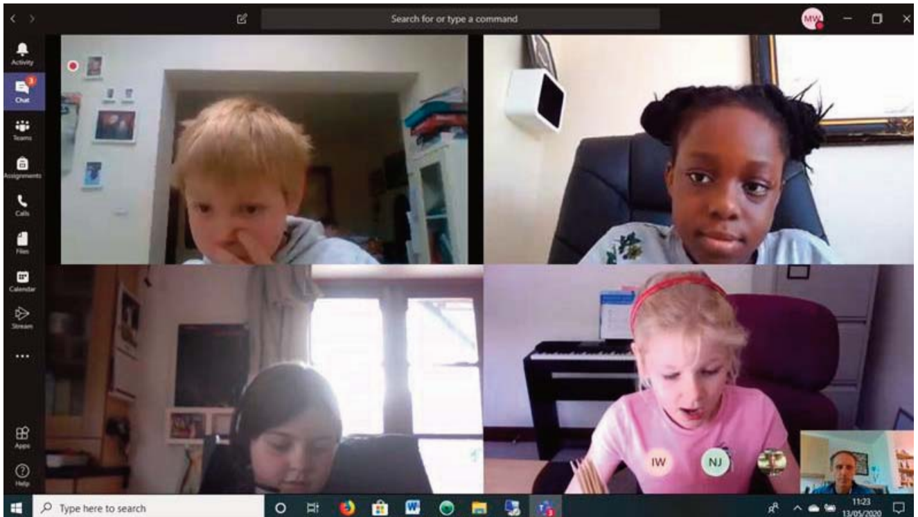
Above: Year 4 online chat