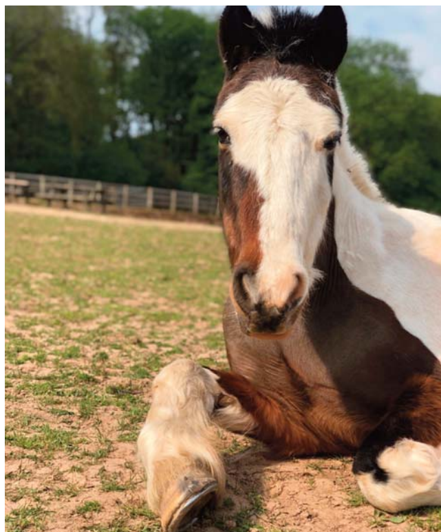
Jig taking it easy!

Stay safe all and we hope you are enjoying the new ways of learning!