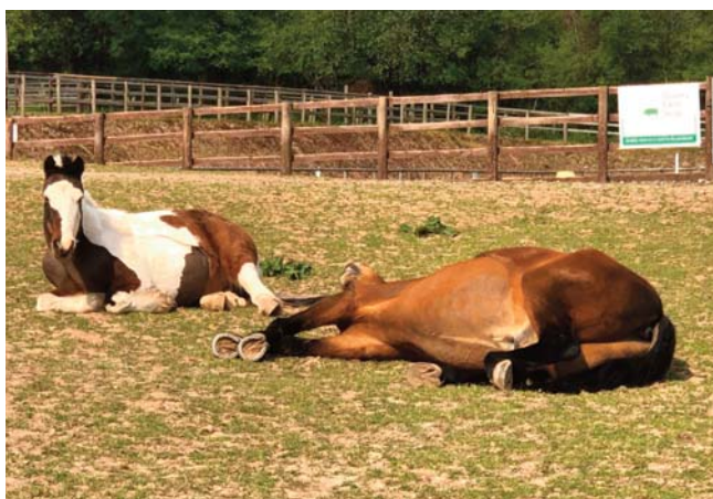
It's an exhausting life for Jig and Mouse.

The grass has started to grow this week so some of us are on strict grass restrictions so as not to get laminitis! Zola was in trouble today when she went out with Alfie, Des and Squirrel because she kept trying to stop and eat cow parsley as they