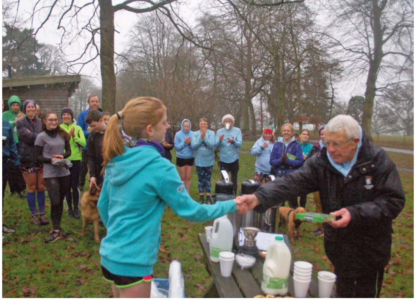
10th January Spring 2020, week 1