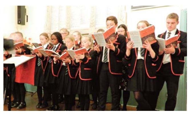
October. Words and Music for Remembrance; Thursday, 7th November at Monkland Church.