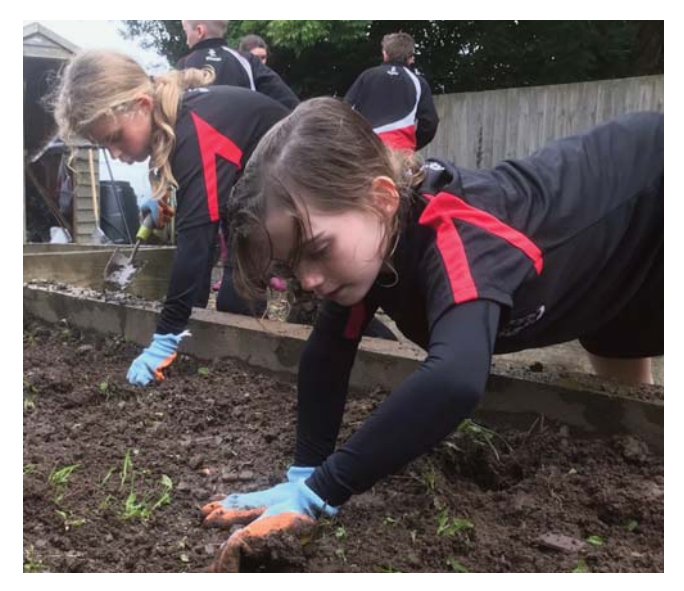
some well-rotted horse manure that we were able to dig into the vegetable beds before planting.

We are very grateful to Ray for delivering