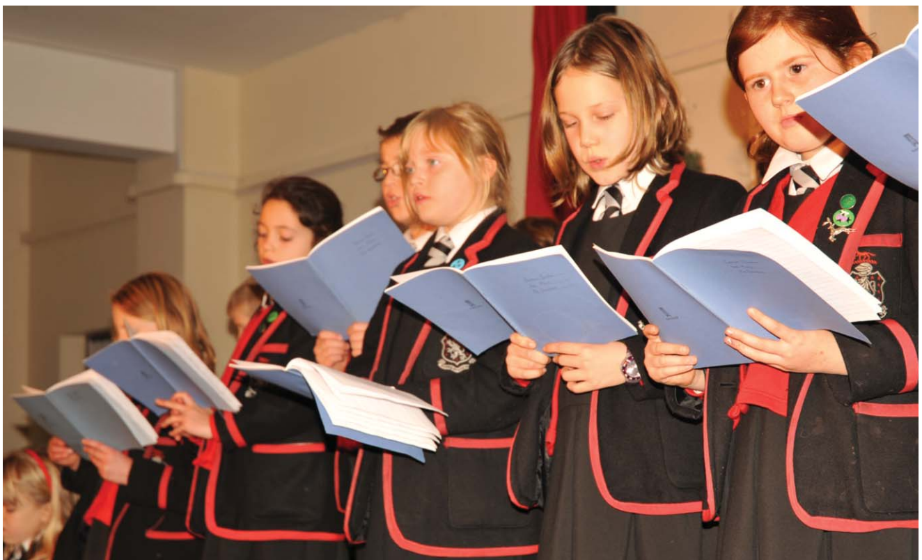
The pageant of poetry and music

For that special Christmas Meal order your Free Range Goodman's Goose or a Free Range Goodman's Bronze Turkey. The geese and turkeys are reared on our Free System at Walsgrove Farm, Gt Witley and are recommended by top food writers & chefs for their succulent, flavour and presentation. They are produced to the highest welfare standards and matured in cold rooms for 7 to 10 days to enhance the flavour.